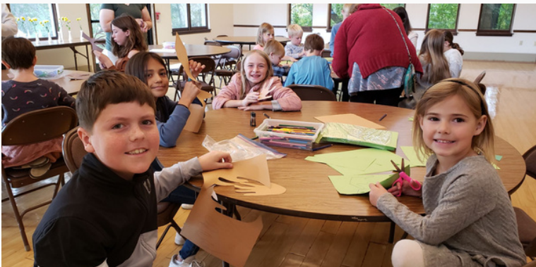
Church School kids busy creating Gratitude Trees on October 13.

If you are not able to join us, you are always welcome to grab the previous month's crafts/activities which are available on the bulletin boards.